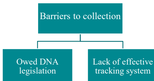
Figure 2. Barriers to Collection of Owed DNA

Owed DNA legislation itself has been identified as a significant contributing factor to the lack of DNA collection (“Lawfully Owed,” n.d.; Melton et al., 2022; FTCoE, 2021; Salinas, 2024). Laws on DNA collection vary from state to state (Melton et al., 2022). There are variations in who is tasked with collecting it, when it is collected in the criminal justice process, and who lawfully owes their DNA to the state (Lovell, 2022). All states mandate DNA collection from individuals convicted of a felony, but some states also mandate that DNA be collected from individuals arrested for qualifying offenses (which may be felonies or misdemeanors) (Melton et al., 2022). Melton et al. (2022) point out that a lack of guidelines for unique circumstances has likely contributed to confusion in the collection process as well, resulting in missed samples.