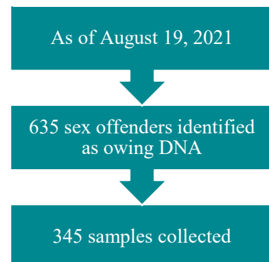
FIGURE 3. WASHINGTON STATE OWED DNA COLLECTION

From 2019 to 2021, the Washington State Attorney General's Office was awarded SAKI grants that were used to identify sex offenders who lawfully owed their DNA to the state ("AG Ferguson's," 2021; SAKI, 2021). As of August 19, 2021, 635 sex offenders were identified as owing their DNA to the state. Of those identified, 345 DNA samples were collected ("AG Ferguson's," 2021). Washington's report is much less detailed in its process for identification and collection of owed DNAs. They do not discuss how individuals who lawfully owed DNA were identified, or how they went about collecting these samples. The report states that "Washington State has not developed a consistent method for collecting DNA upon conviction. Instead, every county implements different